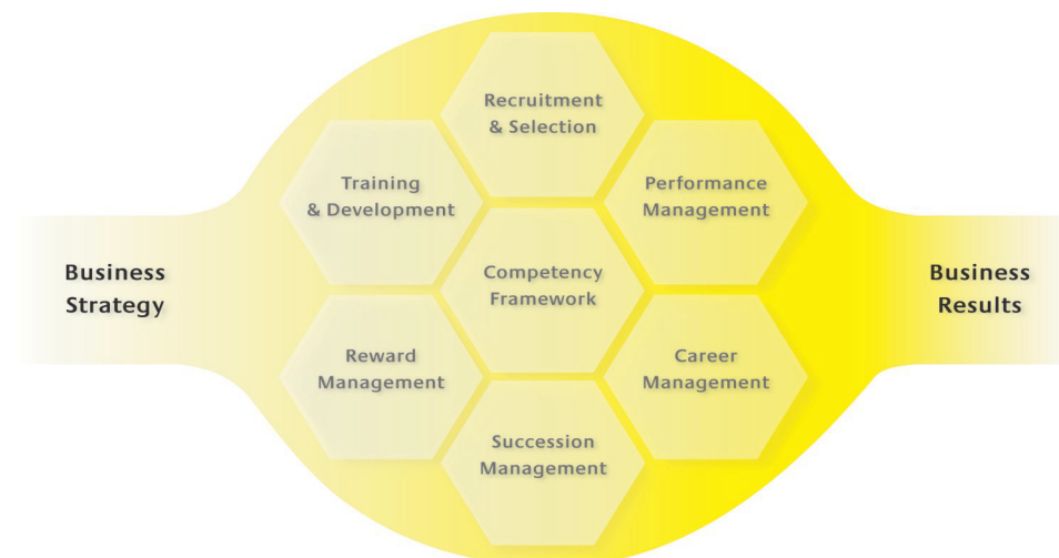
Align HR's Talent Management Framework

Reporting structures and performance metrics need to align and flow from team reporting through to business units and company scorecard. Monitoring results will help determine course of action to ensure continuous improvement.